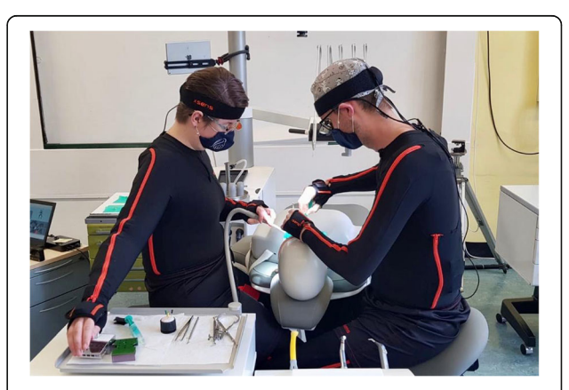
Fig. 2 Treatment of the phantom head when wearing the MVN Link system by Xsens. Subjects can move freely without interference with the measurement system

From the data of the biomechanical analysis, a risk score is determined for every recorded frame using the Rapid Upper Limb Assessment (RULA) [38]. On the basis of this amean score and SD for wrist and arm (Section A) and neck, trunk and leg (Section B) can be determined via RULA [38]. Furthermore, the percentage of time spent in the respective risk scores and at high risk should be determined. Both score values result in an overall score that indicates the level of MSD risk of the examined activity [38].